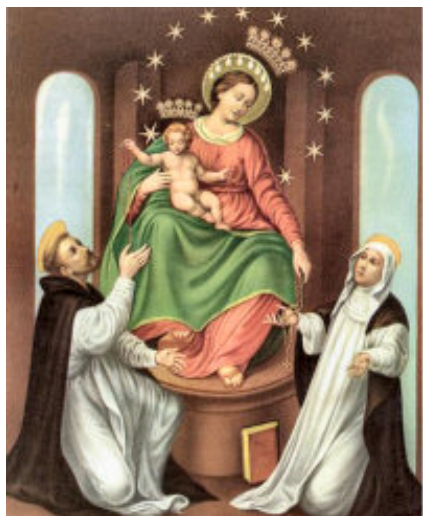
Our Lady of the Rosary, Pray for us!